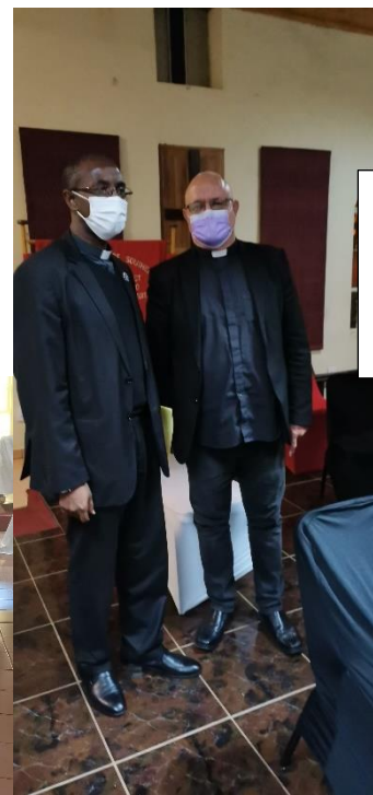
With Rev Shabalala General Secretary of the Council of Swaziland Churches