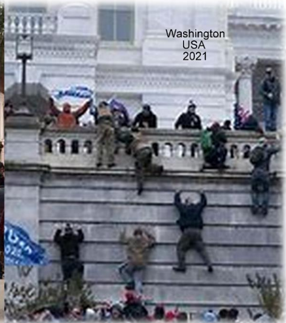
Washington USA 2021