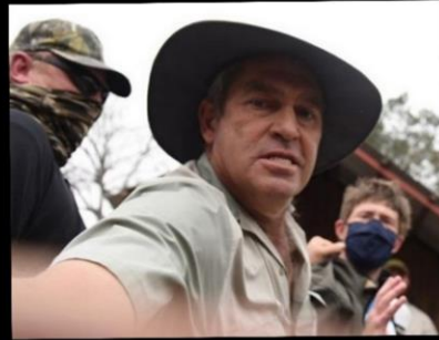
Senekal RSA 2020