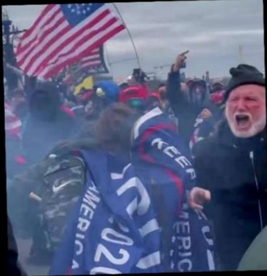
Washington USA 2021