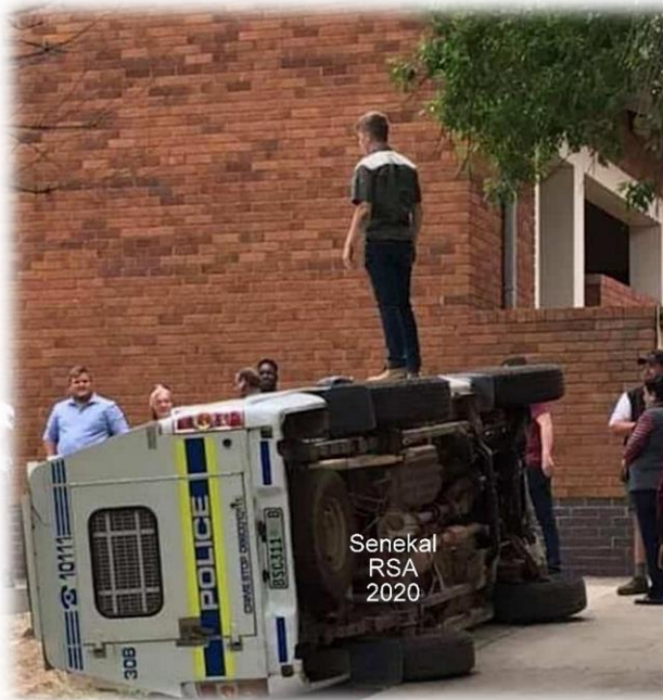
Senekal RSA 2020